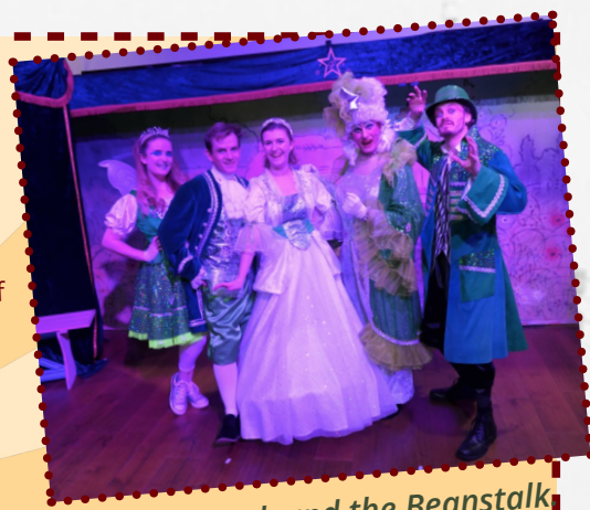
The cast of Jack and the Beanstalk

Following the popular pantomime performed at the Goods Shed by Tetbury Dolphins Dramatic Society in November, Wonder Productions came to the Goods Shed on 2 Jan with their interpretation of Jack and the Beanstalk. Thanks to the success of their show in