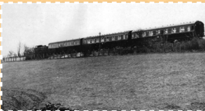
No 1664's last duty on the Tetbury branch, hauling the Westonbirt School end-of-term special on 2 Apr 1964