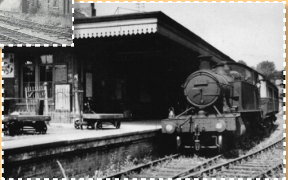
No 4502, a Class 45XX prairie tank engine arrives at Tetbury station in 1948