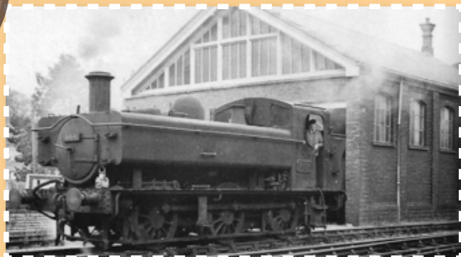
Class 16XX pannier tank No 1664 stands in front of the Goods Shed in July 1962