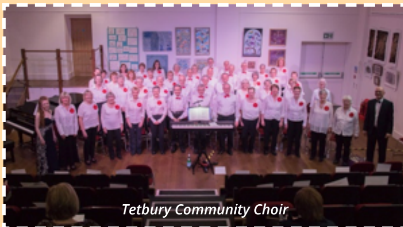
Tetbury Community Choir