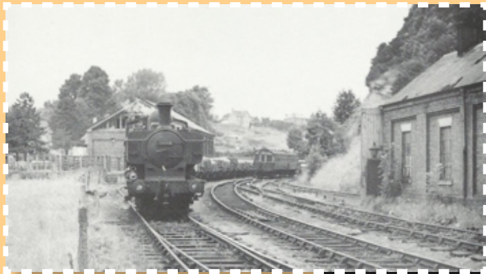
Class 57xx 0-6-0 pannier tank, No 3666, shunting wagons into the goods yard.