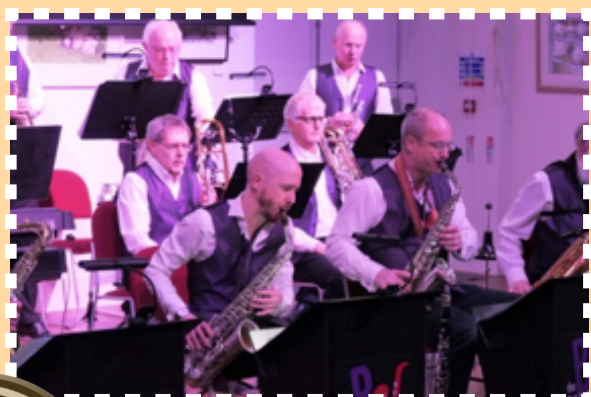
BJ Big Band