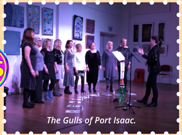
The Gulls of Port Isaac.