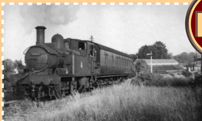
Built in 1933, a slight variant of the 48XX class, No 5800, leaves Kemble on its way to Tetbury in July 1954