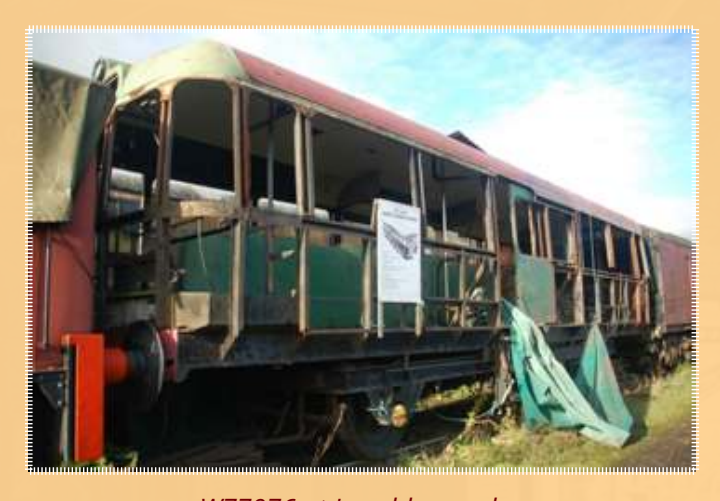
W77976 at Loughborough