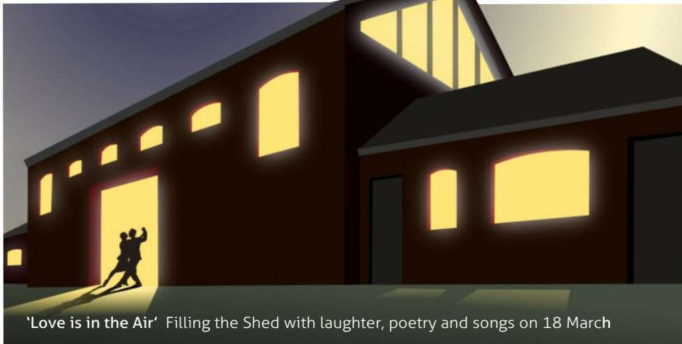
'Love is in the Air' Filling the Shed with laughter, poetry and songs on 18 March

We will highlight a selection of events in every newsletter but our new website (see below) should be your first call in future to get the details. We do hope that we shall see you all making the most of our wonderful new asset.