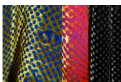
Liz Lippiatt Textile printing workshop 25 May