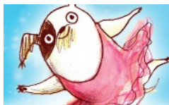
Blunderbus Theatre Children's Theatre 20 May